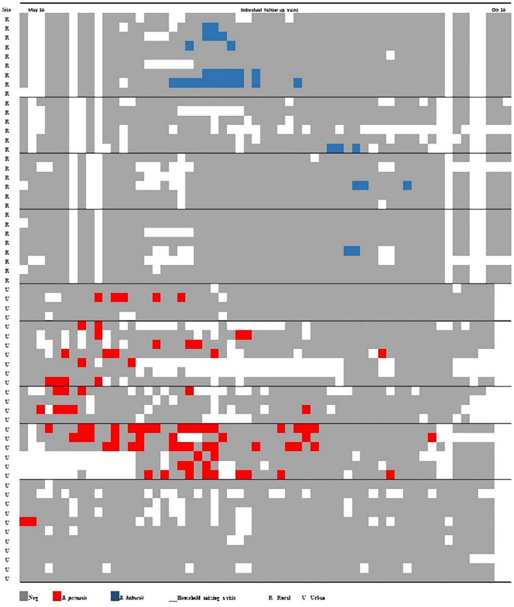
Appendix Figure 1. Community Bordetella pertussis and B. holmesii infections among study participants (households with cases only) by site, PHIRST study, South Africa, 2016. Columns Indicate individual follow-up visits, and rows indicate individual study participants. R, rural; U, urban.